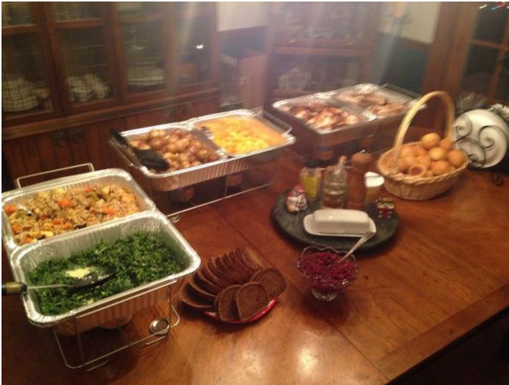
The wonderful Yule feast