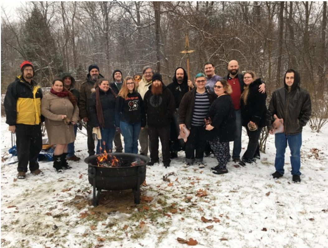
Skylands Ásatrú Fellowship celebrate Yule with friends

Thanks to all the members of Skylands, our friends, family, and guests who made Yule such a memorable occasion. Hail the gods, and hail the tribe!