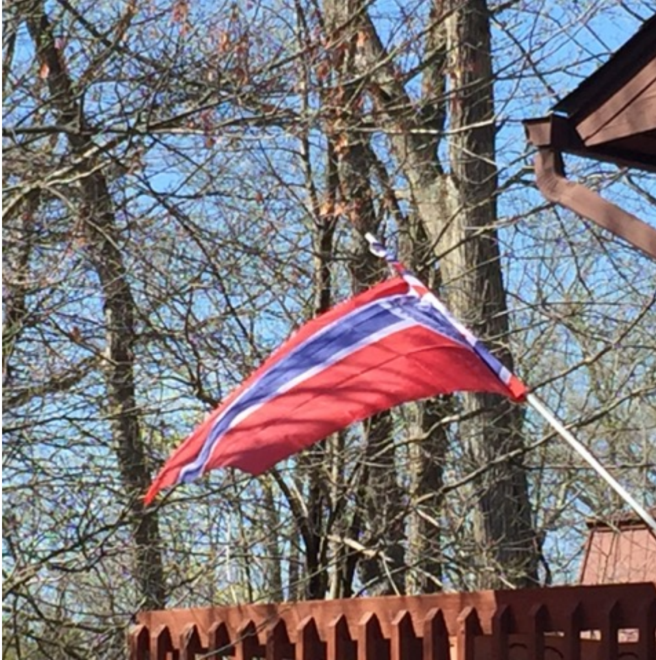
The SAF flag waves over one of our 2016 celebrations