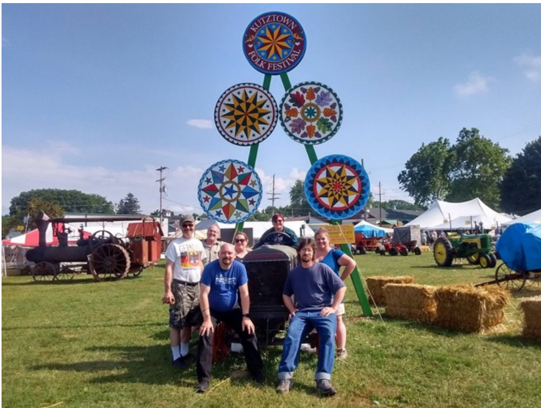
July 10 – Kutztown Folk Festival