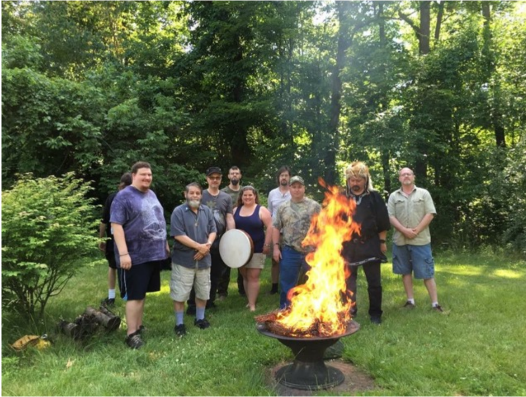
June 25 – Midsummer Celebration