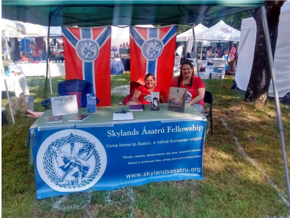
September 4 – Scandinavian Festival